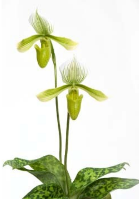
Paphiopedilum Maudiae is a perennial favorite slipper orchid.

Cattleya purpurata , formerly in the genus Laelia , is without a doubt one of the most stately orchids to bloom in this season.